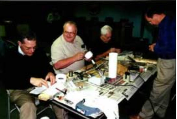
K1JT, KA3MGB and WA3IUUV work on their rigs with an unidentified assistant-

be moved independently to capture the incoming signal without moving the transmitter beam. If you use the PVC cap with its velcro attachment to the audio amp without the 12” hood, it can generally stand alone on any surface. Others might want to fashion an adjustable stand, or use another tripod, as once the 12” hood is attached, it could use a strap or two circumferentially to hold it in place. Keeping the two units separately also allows for testing of your own unit.