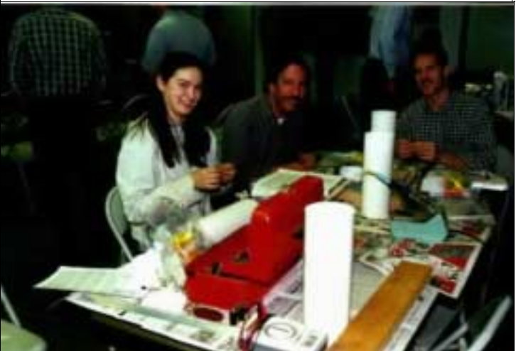
KB3BBR, WA3DRC and W2PED are happily at work