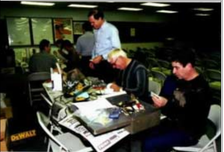
WA3RLT, W2SJ and W3ITT assemble their communicators